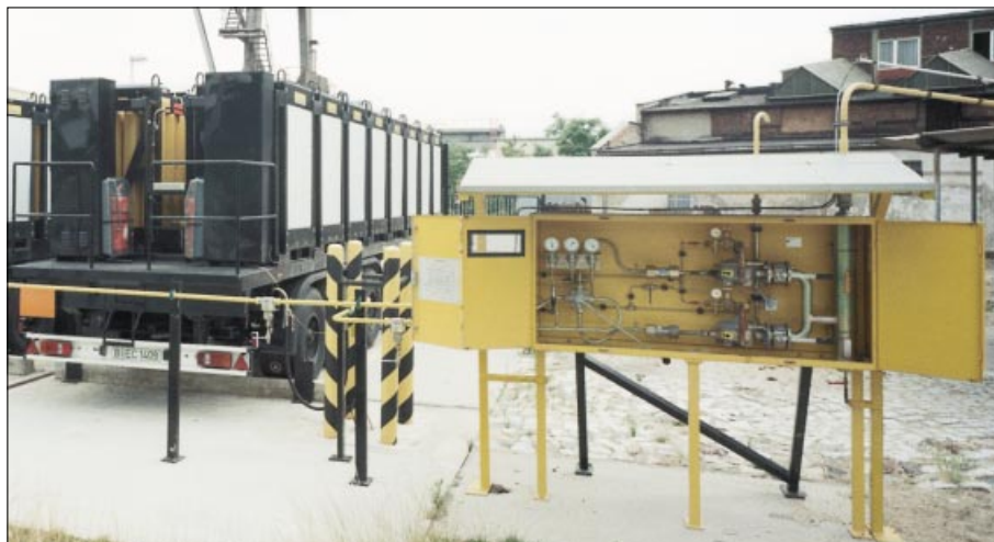
Figure 2: Typical acetylene supply facility, mainly consisting of the obligatory, immobile pressure control unit (LINDOMATIK®) and two acetylene transport assemblies; in this case two 16-bundle trailers with 16 cylinders per bundle, in total placing an acetylene capacity of 2 x 2300 kilogram at customer's disposal.